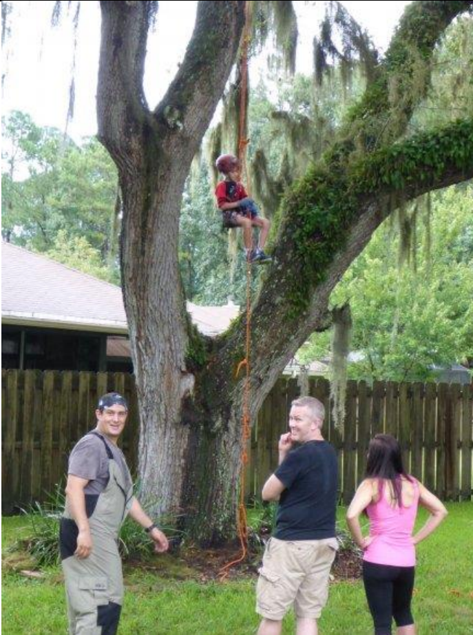
Figure 3 - New Climber getting Vertical