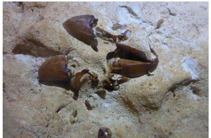
Figure 2 - Two crab fossils in The Fossil Hall

Catacombs Cave: TBAG had a trip August 22nd, but no report to us.